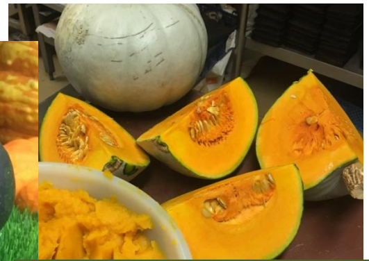
The amazing colours of the Crown Prince